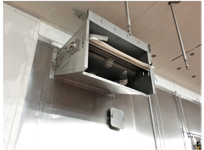
Advanced ASFS 24-762-3350-110